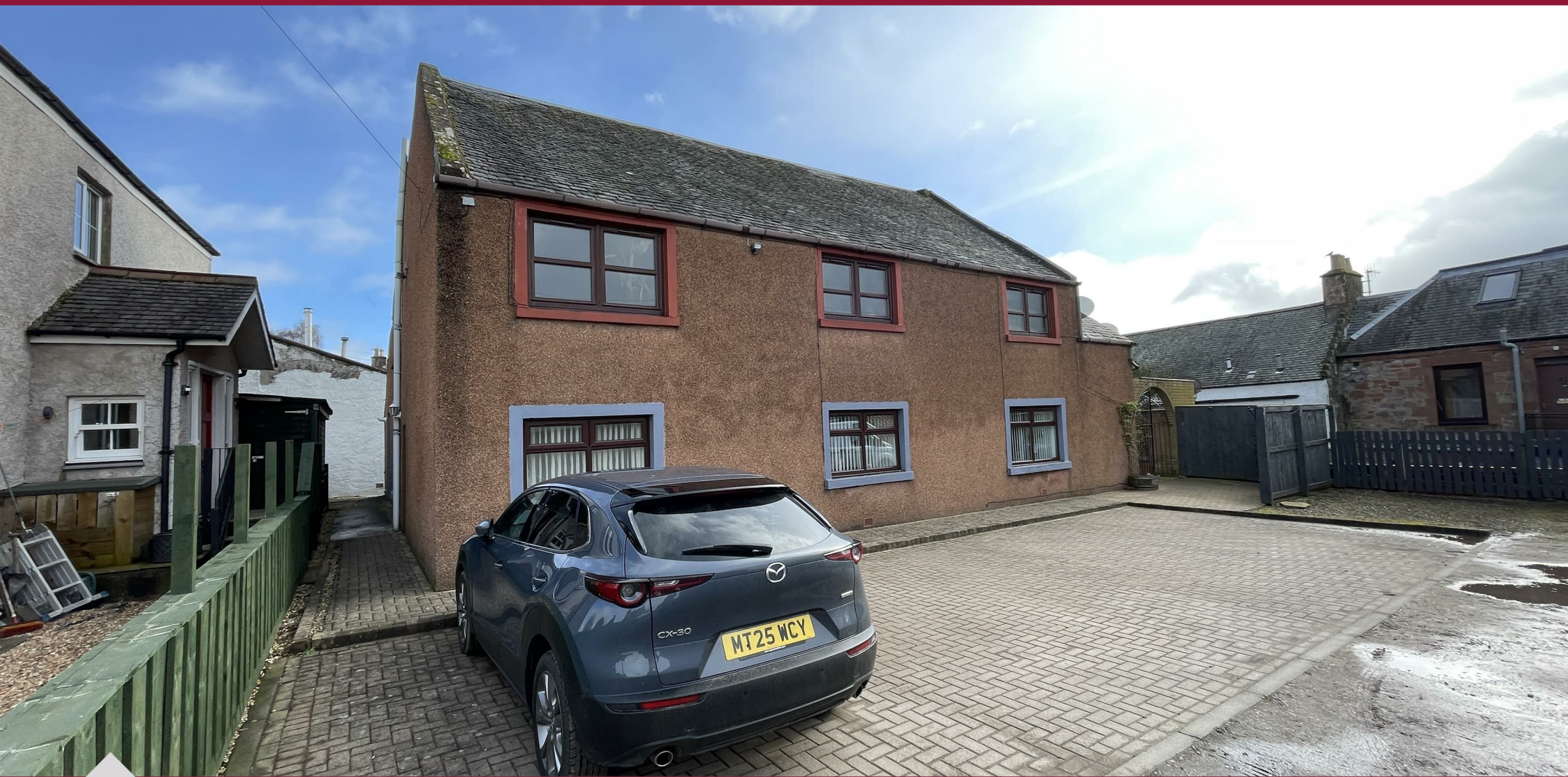
Old Picture House Back Dykes, Strathmiglo, KY14 7QJ Offers Over £160,000